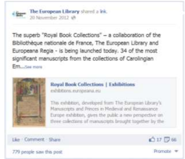
A Facebook post promoting the Manuscripts And Princes exhibition.

The second exhibition was "Science and machines - Scientific and technological development since 1800"<sup>24</sup>, with more than 600 images, videos and historical documents. Twenty-two research and national libraries contributed material.