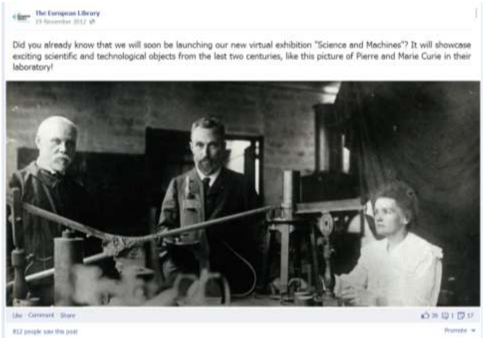
A Facebook post, promoting the virtual exhibition "Science and Machines".

Awareness about the exhibition was raised by participating libraries, who translated and distributed the press release to their users. The European Library and Europeana also informed press and general users about the exhibition.