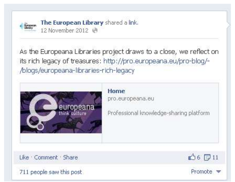
A typical Facebook post about the Europeana Libraries project.

Posts were also shared on Facebook, such as this one linking to a website article about the achievements of the Europeana Libraries project.